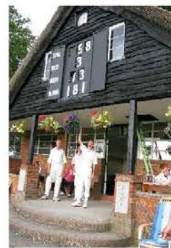
Village cricket match