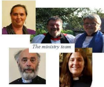
The ministry team