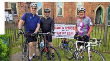
Ride and Stride