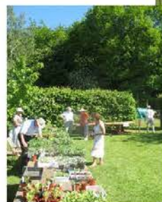
The Plant Sale