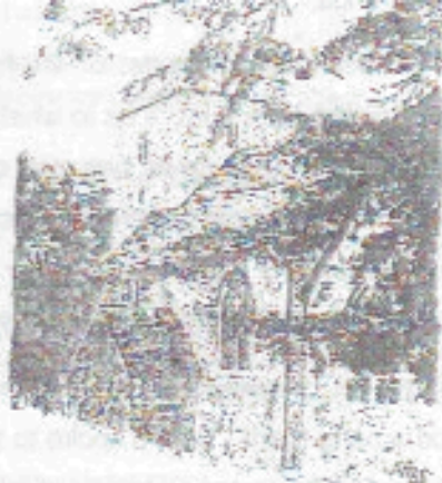
Illustration of All Saints' after Harold Harbour.

"Even the thinnest lifeline can be used to draw in a stronger rope" (Anon. 20th C.)