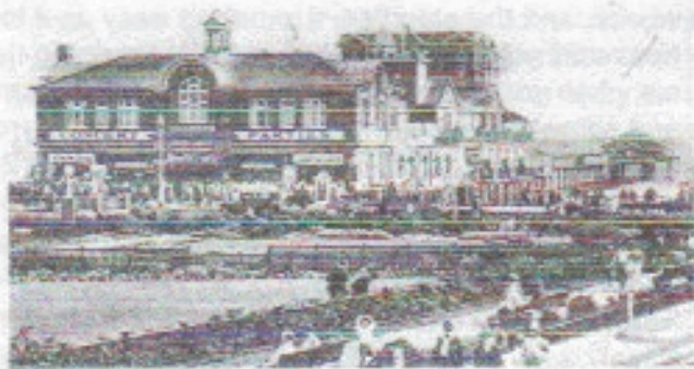
Bognor Pier - early last century.