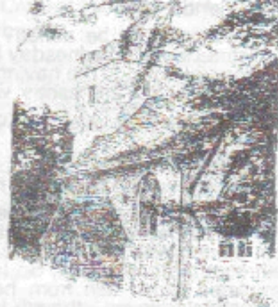
Illustration of All Saints' after Harold Harbour.

A Lifeline is of no use without a means of propelling it to where it's needed.