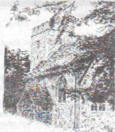
Illustration of All Saints' after Harold Harbours.

Distributed freely in December 2008 Edition No. 395