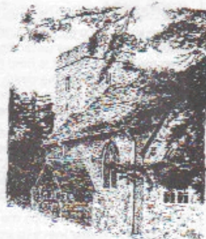
Illustration of All Saints' after Harold Harbour.

We've run out of "Lifeline" quotations—any ideas? Contact the editors.